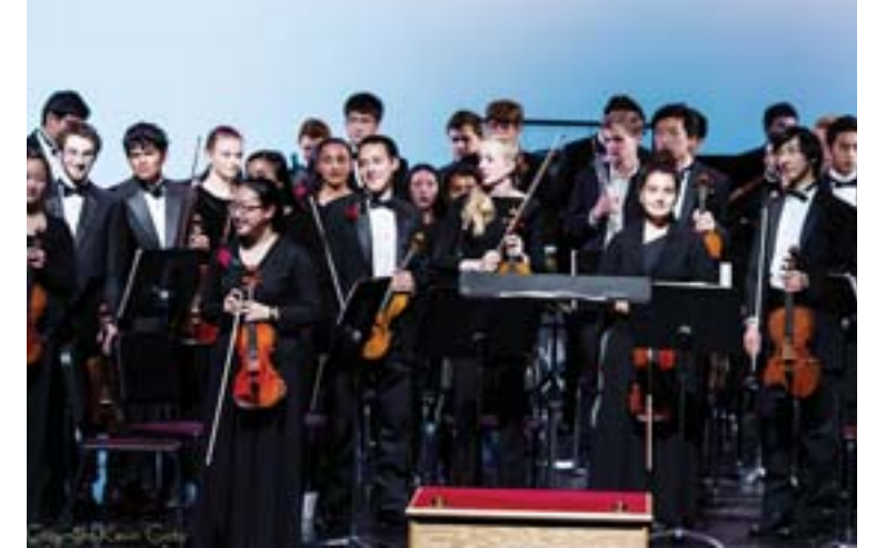
Performers at last year's Dinner Dance